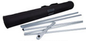
Protective Carrying Bag