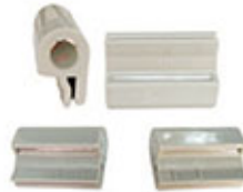
Optional - Magnetic Banner Lock