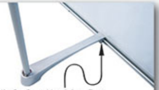
Clip On Cast Aluminium Foot