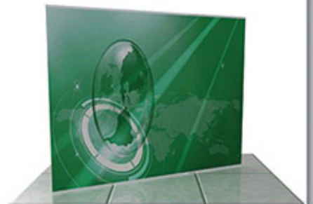
Connect Together With Angles Or Straight Magnetic Banner Lock