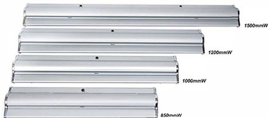
Choice Of 4 Widths