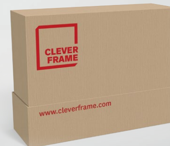
Additional in the set: 2 x graphic panel bag 1 x connectors bag