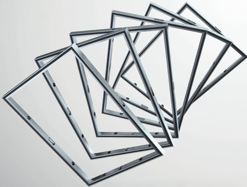
6x frame 100x75 cm