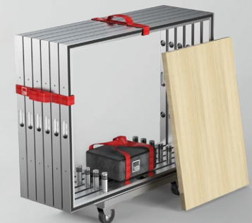
Trolley and PROMO1 top 75x50 cm