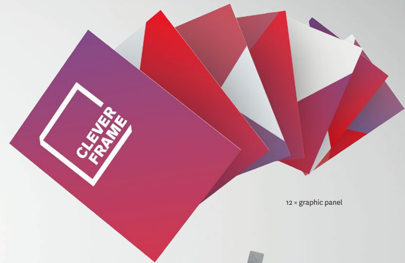
12 x graphic panel