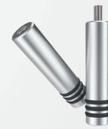
12 set of connectors